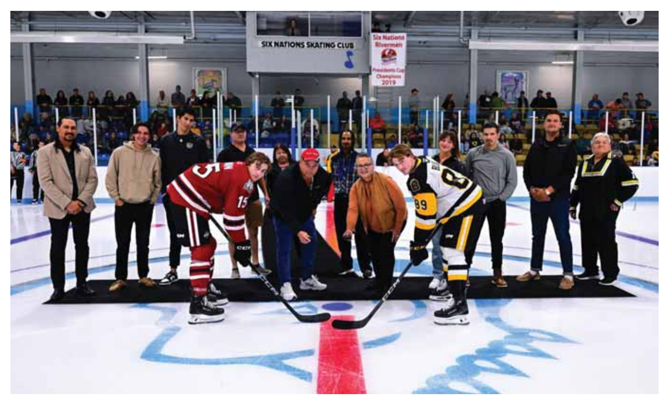
Six Nations took centre stage when the Brantford Bulldogs hosted the Guelph Storm on September 22 for an Ontario Hockey League exhibition game.